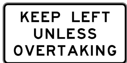
Figure 1: R6-29

The KLUO sign (R6-29) is to be used in accordance and in conjunction with the Australian Road Rules. It is clear that the rule is not intended to apply to all roads. However, under certain conditions it may be appropriate to apply the rule to some 80 km/h roads. It is not proposed to apply the rule to roads zoned less than 80 km/h speed in South Australia.