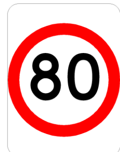
Figure 2: R4-1(80)