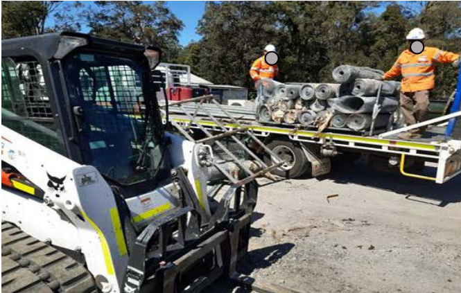
Example of no edge protection

Assess the risks for fall from height potential when needing to load, unload or access a traytop or trailer.