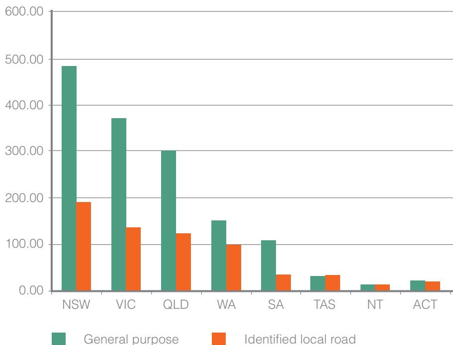
State Entitlements: General Purpose and Local Roads Funding 2012-13

In 2012-13, the Supplementary Local Road Funding program will provide $16.25 million, which will be distributed in the same manner as the identified local roads grants (i.e., 85 per cent proportionally allocated to formulae grants and 15 per cent to special local road grants).