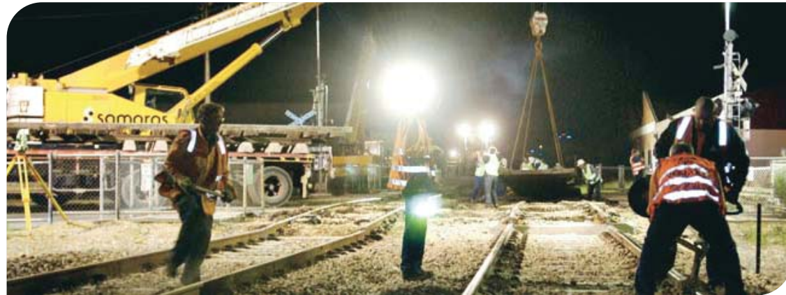
Some night work may be necessary to renew the line as quickly as possible.