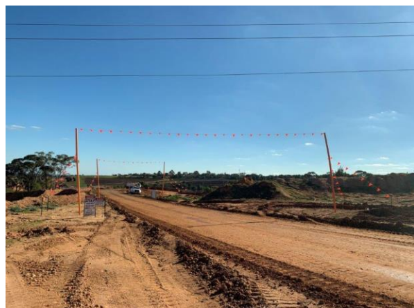
Flagging used to define overhead safety zone