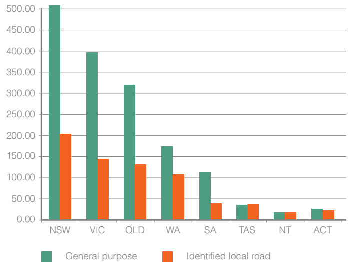
Summary of Grants for 2016-17: Based on Final Estimates – July 2016

Projects may be funded out of each of these pools of funding or a combination of both pools and grants are tied for the specific project.