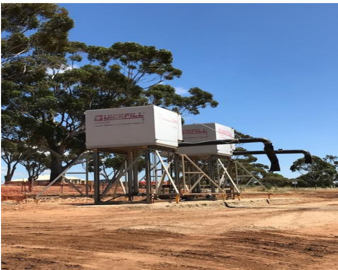
Water tanks used to supply water to the water carts