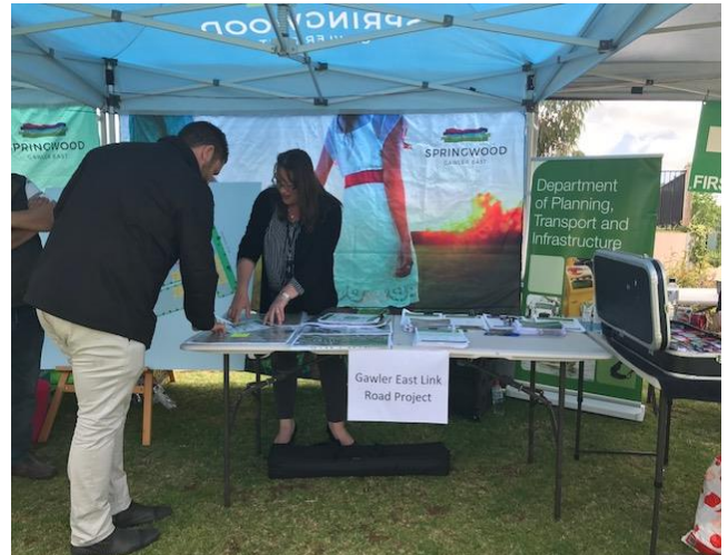
GELR project speaking with the community members at the Springwood Community Day