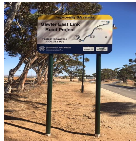
New Gawler East Link Road Project signage