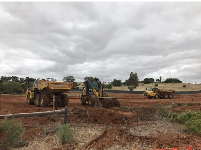
Vegetation & tree removal in preparation for the road corridor

While some dust is unavoidable during major construction works, the project has implemented an Air Quality and Dust Management Plan (AQDMP), which outlines the strategies to minimise the generation of dust.