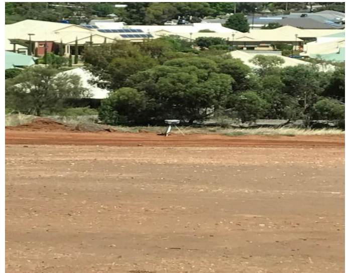
Above: Dust monitor placed along the GELR corridor to record dust levels

As part of the AQDMP, the project uses real time dust monitors. The dust monitors are placed in strategic locations to measure dust levels during construction activities. If required, construction methods will be changed to reduce impacts where possible.