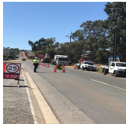
Traffic management for service relocation works along Potts Road