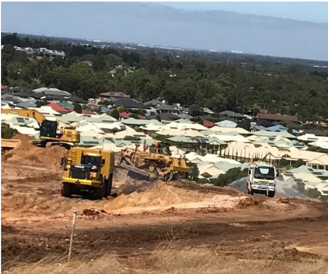
Watercart spraying water as a dust mitigation measure