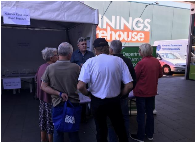
Speaking with community members during the GELR Information sessions at Gawler Green Shopping Centre

Community information sessions were held in October 2018, at the Gawler Green Shopping Centre. Approximately 370 community members attended to learn more about the project, see the changes that have been made, learn about the upcoming works and provide feedback.