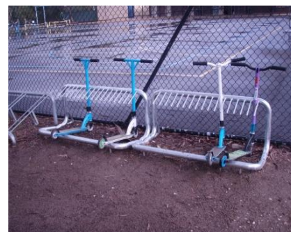
Way2Go Bike Grant Scooter Parking Tanunda Primary School

"it was awesome; hope you can come back soon; it was soooooo much fun; I could go on for ages about how much I learnt; you helped me when I was stuck; I wouldn't have been able to change gears properly if it wasn't for you guys ... I'm getting a new bike with gears for my birthday; "